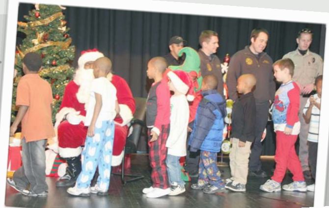
Children say hello to Santa and Mrs. Claus and receive gifts from Police Officers and Firemen at the holiday party.