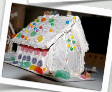
Teens at the 21st & Opportunity Club made ginger bread houses to display throughout the club.