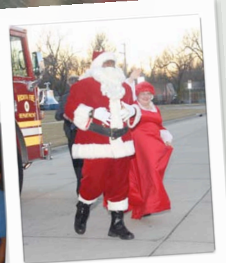
Santa and Mrs. Claus hop off of the fire truck to greet the children cheering outside of the 21st & Opportunity Club.