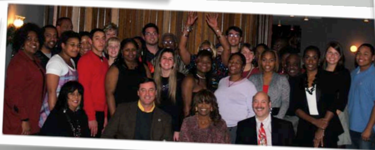
The Boys & Girls Clubs of South Central Kansas staff gathers for a photo at the holiday party on Monday, December 14th.