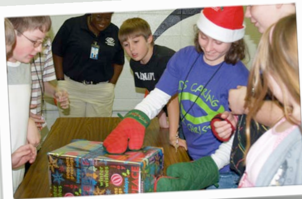
Students in the Haysville after-school program try to unwrap presents with oven mitts during their holiday party.